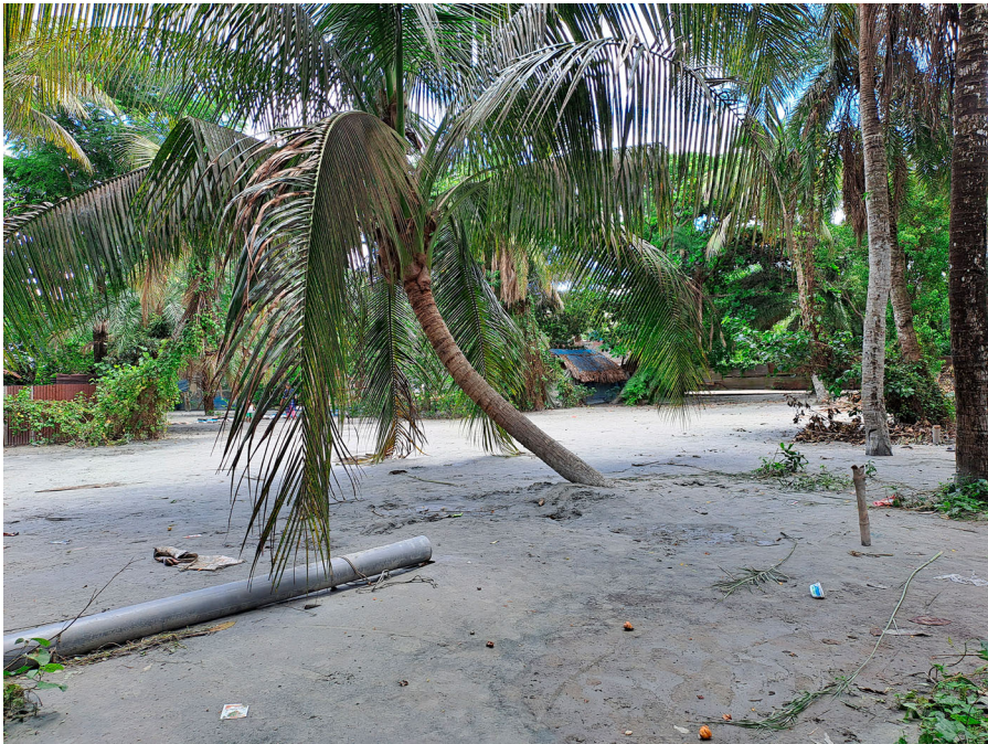
Figure 2. A pond in Mongla recently filled with dredged sand.

The crisis narrative framing of the “climate refugee” idea therefore obscures the multi-causality of household migration decisions, and downplays the complex, systemic nature of livelihoods and resources in Mongla. For example, while dredging has positive implications for keeping the port functional, it also is adversely affecting agriculture-based livelihoods in adjacent areas and may paradoxically drive more migrants to head for